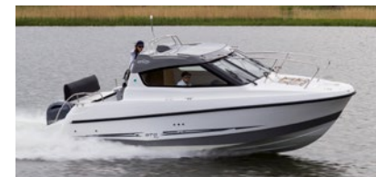
670 Middle Cabin